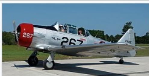
"Nella", owned by the Commemorative Air Force , preparing for take off