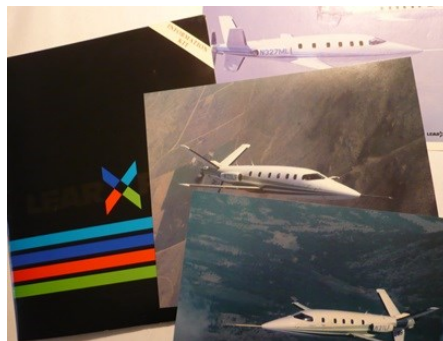
Promotion Kit with photos and brochure.