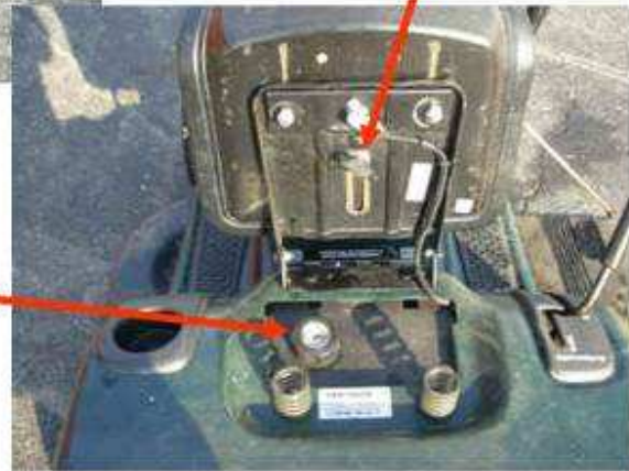
Fuel Tank and Gage (Under Seat)