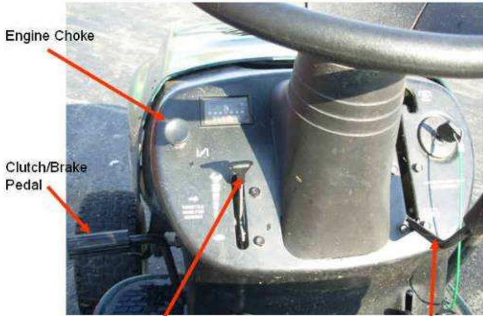
Throttle lever in "Full Throttle Position"