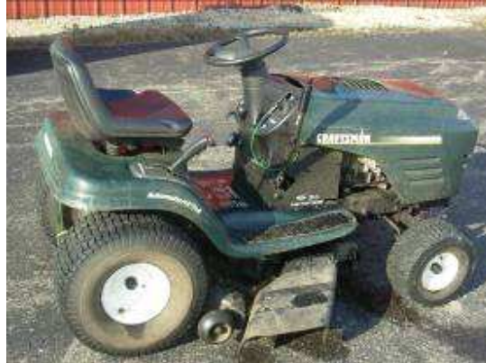
Club Rotary Mower