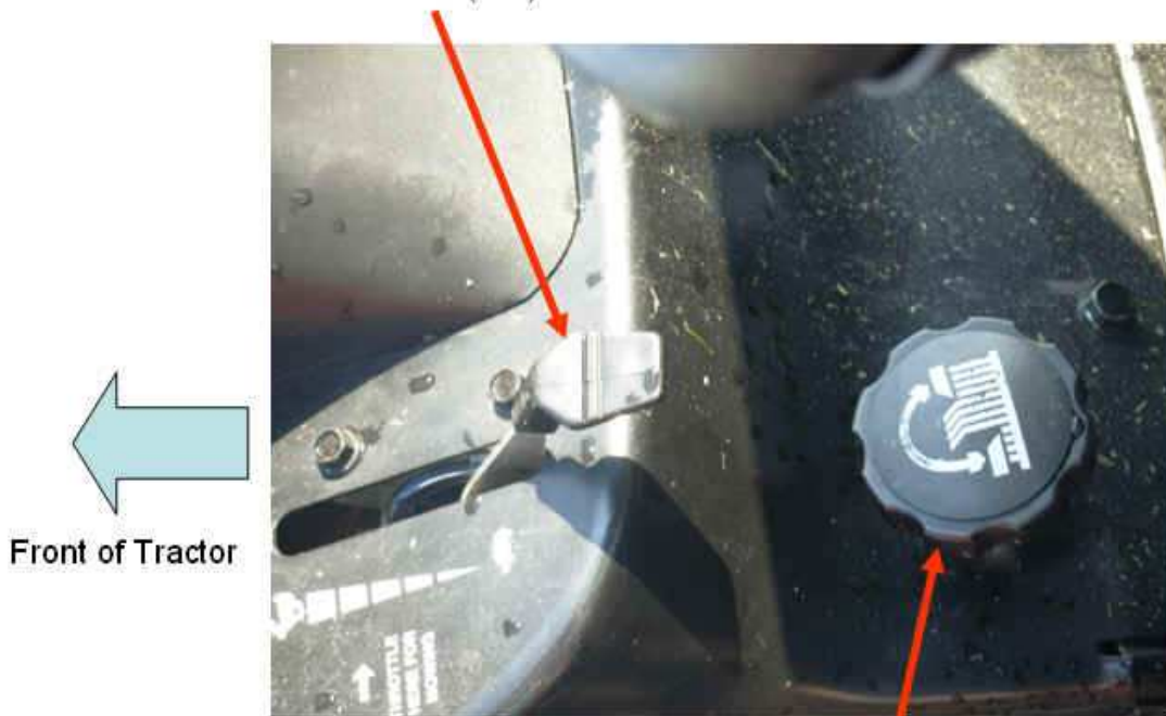
Front of Tractor