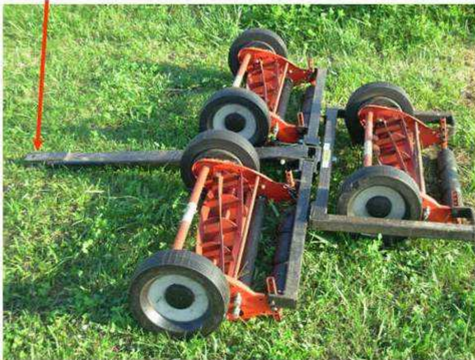
Hitch Tongue of Reel Mower