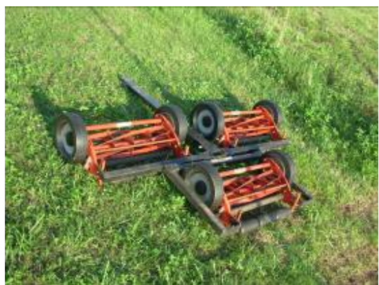
Club Reel Mower

The best time to mow the field is early afternoon when the grass is dry. This is especially true when using the reel mower. If you need to mow earlier in the day because of your schedule then pay particular attention to the reels on the reel mower. In wet grass they MAY stop spinning as the drive wheels slip. Also wet grass may build up between the reel blades and the cutter bar and not allow the blades to spin. If this happens try backing up for a short distance with the mower in order to loosen the grass. Then pull forward and watch to see if the reel begins to spin. If this doesn't help then SHUT OFF the tractor and dismount it. On the reel that is not spinning grasp one of the wheels (NOT THE REELS!!) and turn it by hand in a forward direction. This will exhaust any clogged grass. USE EXTREME CAUTION when doing this! Do not place your hands near the reels as they spin. Then continue to mow per the guidelines below.