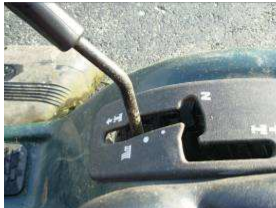
Ground speed lever location for reel mowing

This setting gives a ground speed of approximately 4mph. (Remember that the throttle lever needs to be set at full throttle or highest speed).