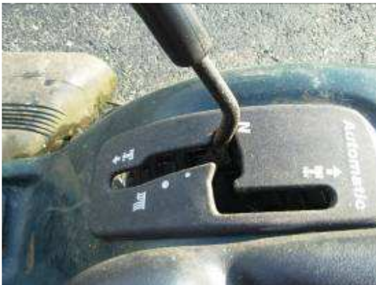
Ground speed lever in Neutral

To ensure the tractor ground speed is correct when preparing to use the reel mower pull the ground speed lever to the neutral position, then move the lever forward until you reach the first stop or indent on the right side of the tractor speed indicator panel. (See Illustration below)